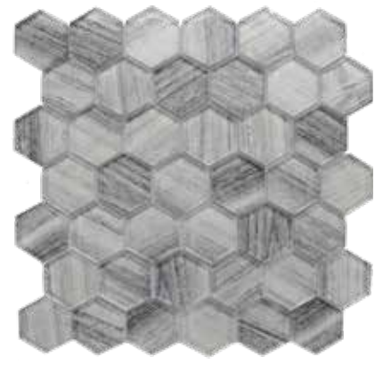
2x2 Hexagon GLAEXWHHEX2