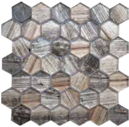
2x2 Hexagon GLAEXBEHEX2