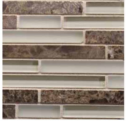
GLA CNNO LIN