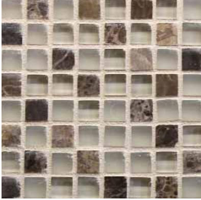
GLA CNNO 58