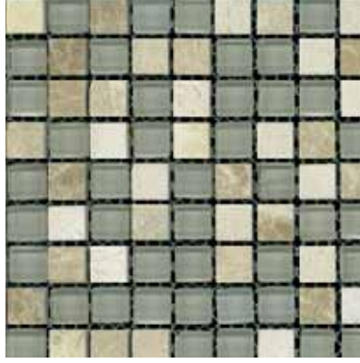
| 5/8 x 5/8 |