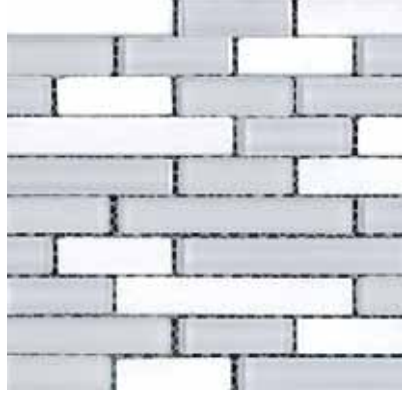
GLA CNPO LIN