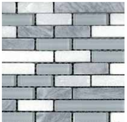
GLA CNSH LIN