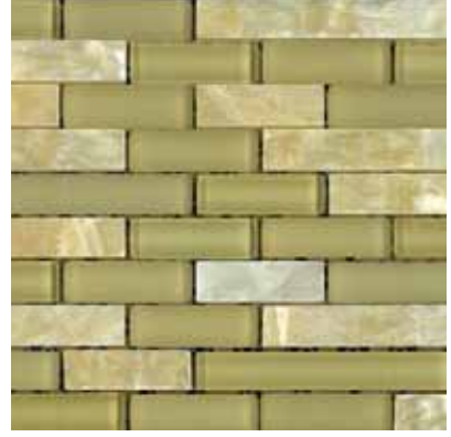
GLA CNDU LIN