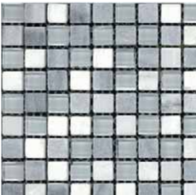
GLA CNSH 58