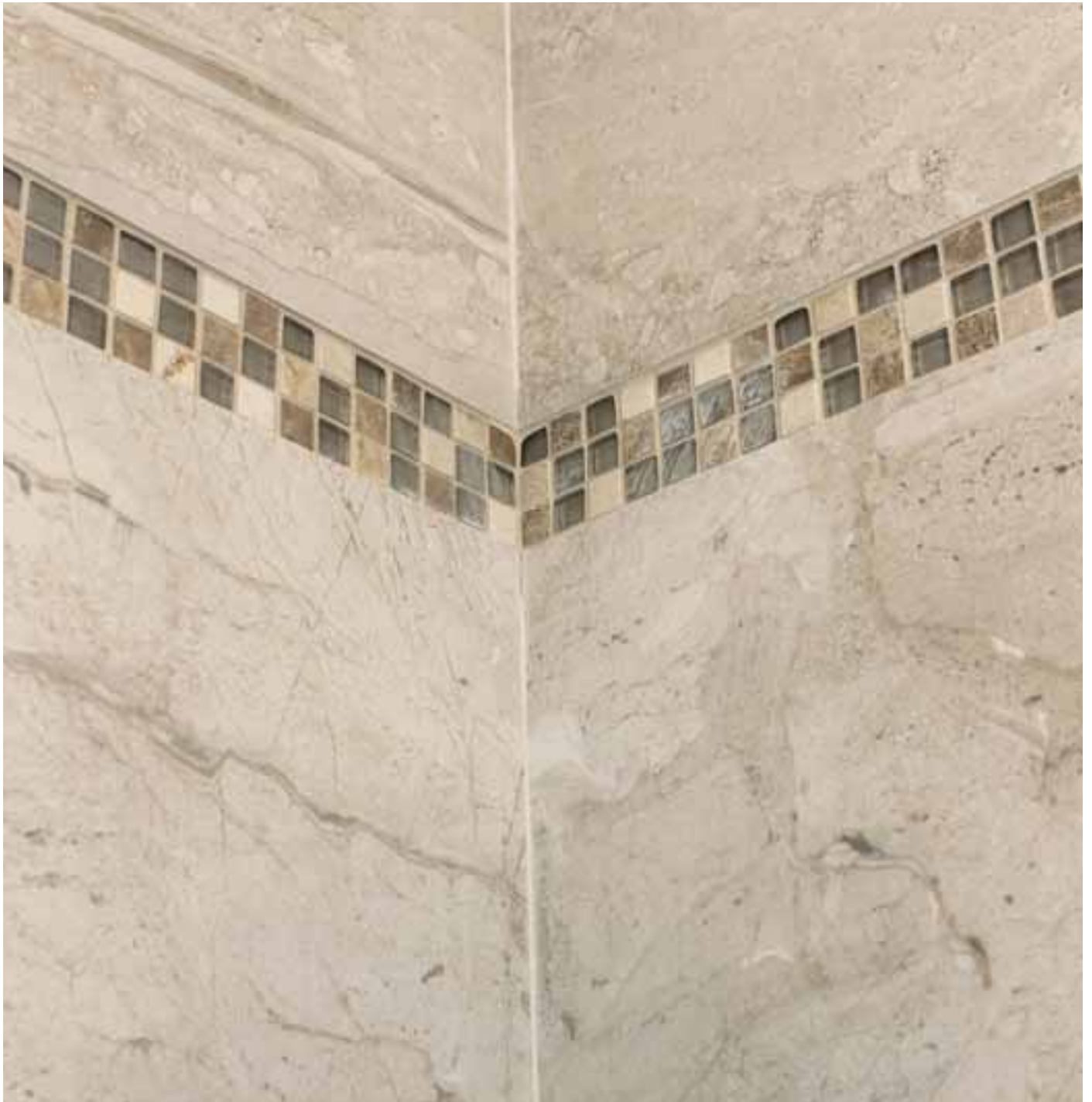
BUFF • 5/8 x 5/8