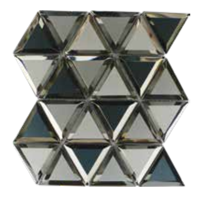
Triangle Grey Mix GLAMMGMTRI