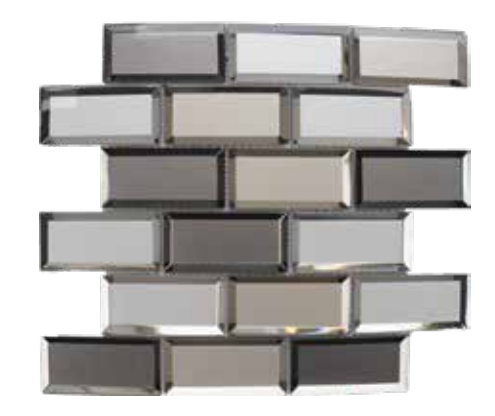
4x2 Beige Mix GLAMMBM42