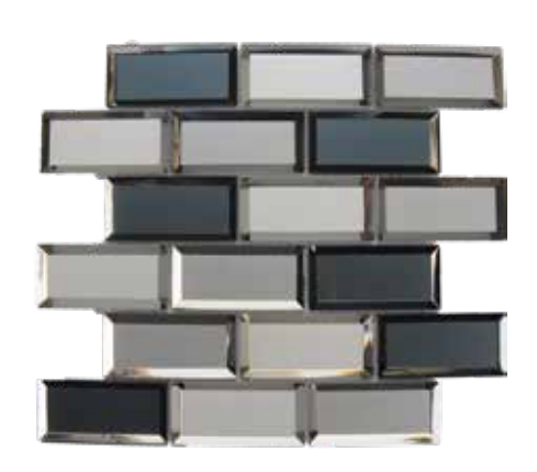
4x2 Grey Mix GLAMMGM42