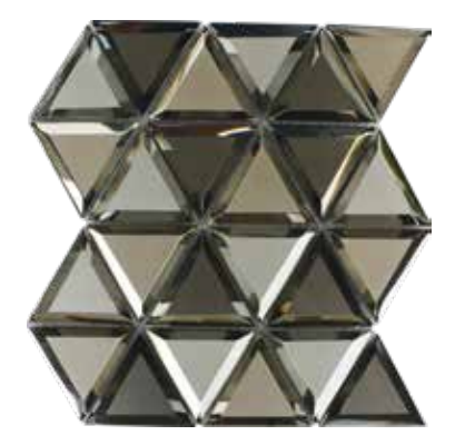
Triangle Beige Mix GLAMMBMTRI