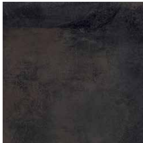
| 24x24 |