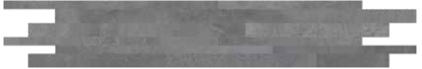
| 6.5x40 3D lineality |