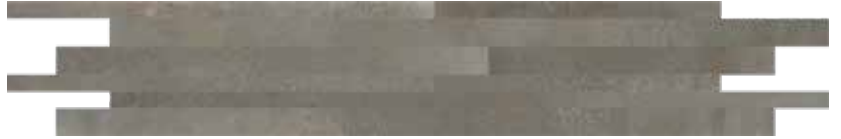
| 6.5x40 3D lineality |