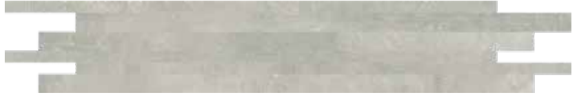
| 6.5x40 3D lineality |