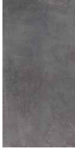
| 12x24 |