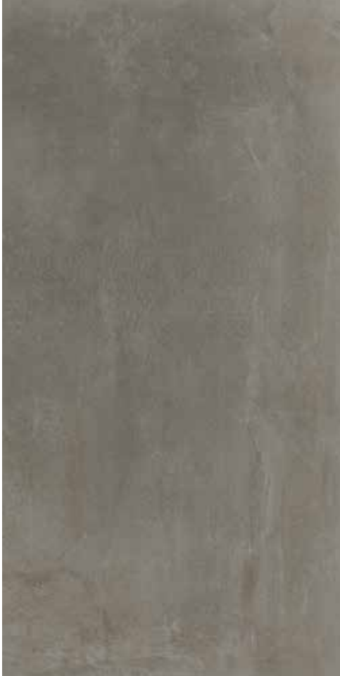
| 24x48 |