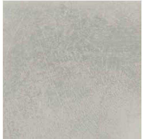
| 24x24 |