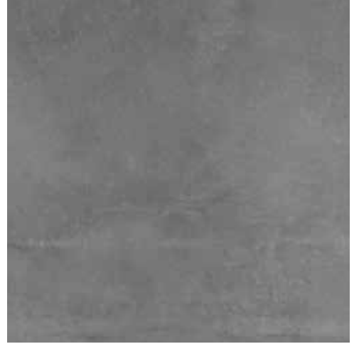
| 24x24 |