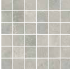
| 2x2 mosaic |