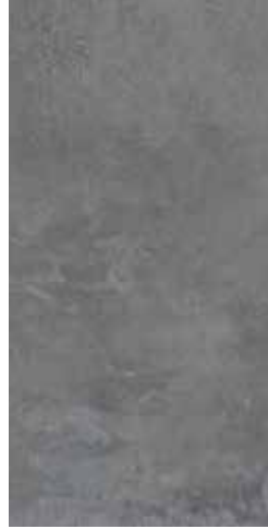
| 12x24 |