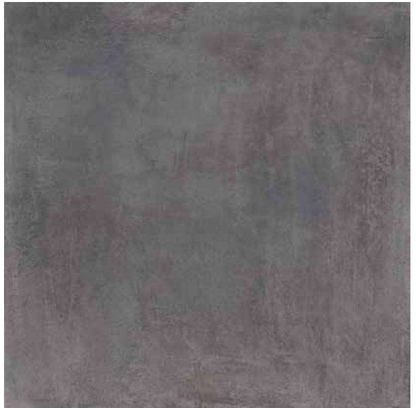
| 40x40 |