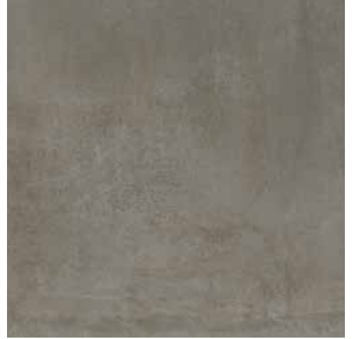
| 24x24 |