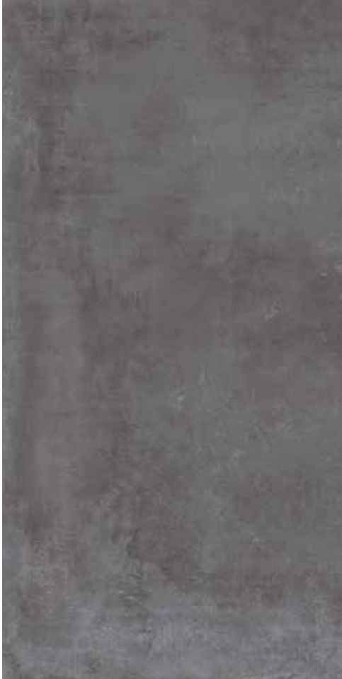
| 24x48 |