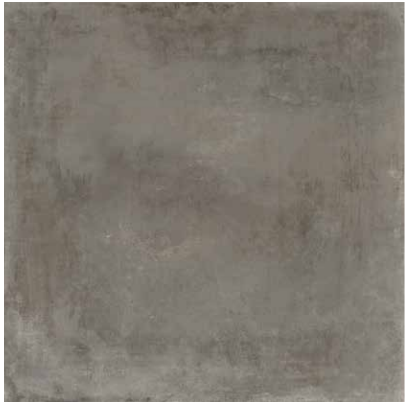
| 40x40 |