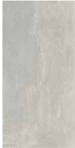
| 12x24 |