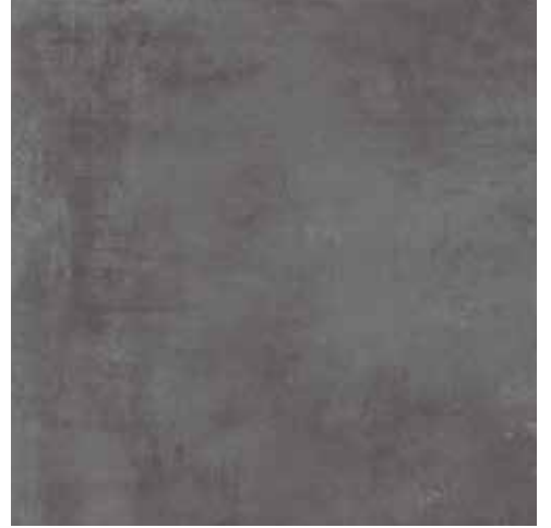
| 24x24 |