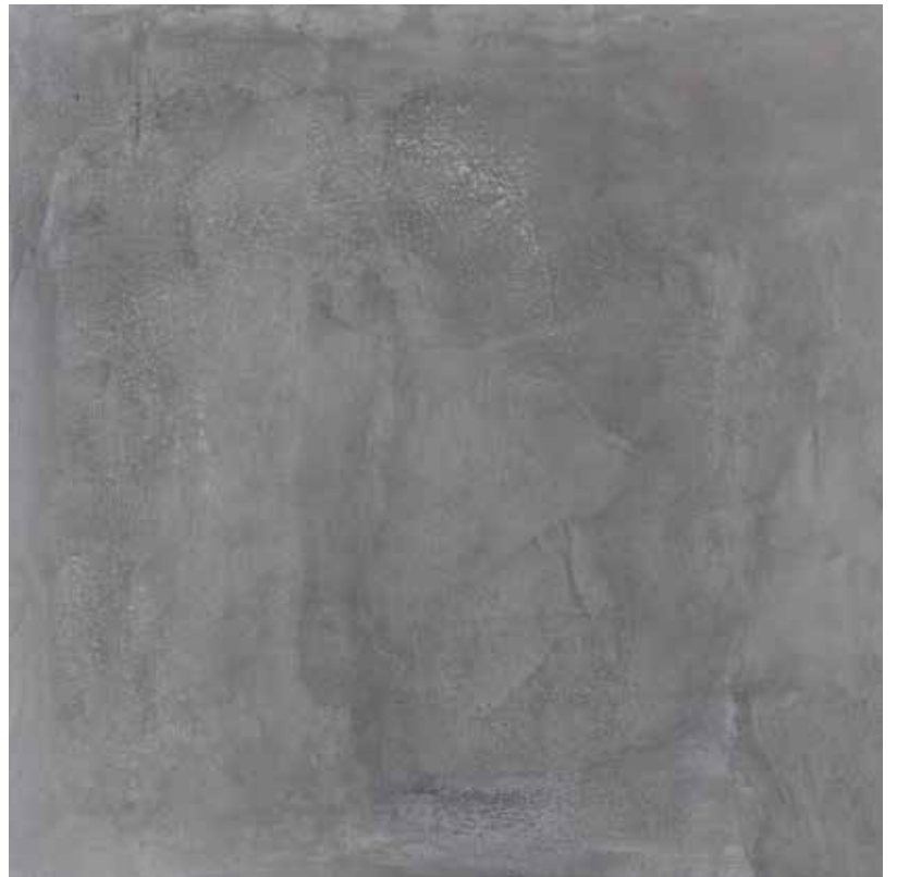
| 40x40 |