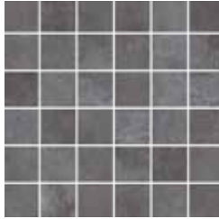
| 2x2 mosaic |