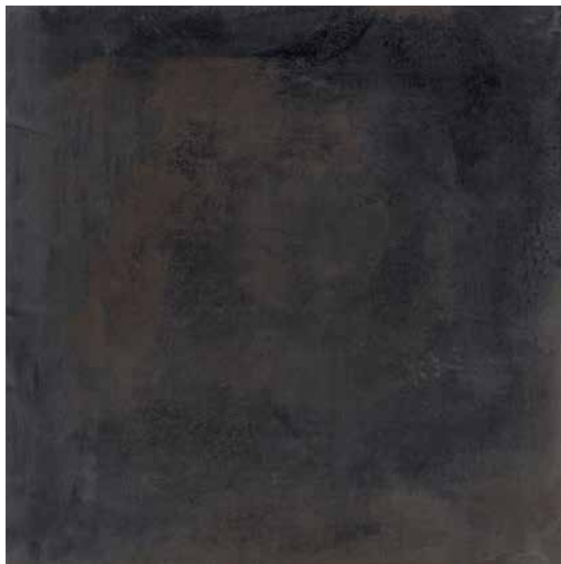
| 40x40 |