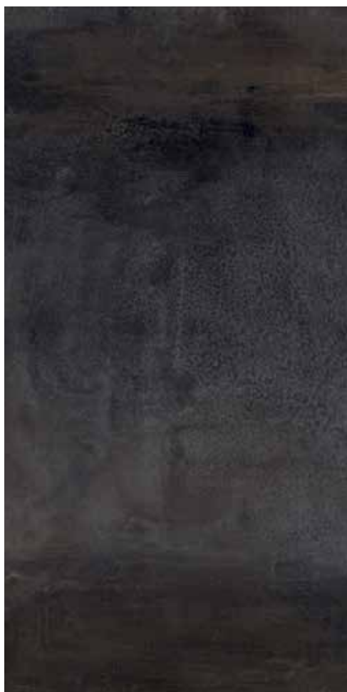
| 24x48 |