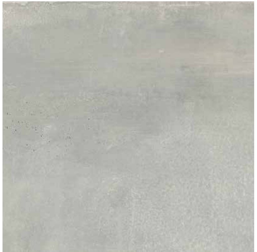
| 40x40 |