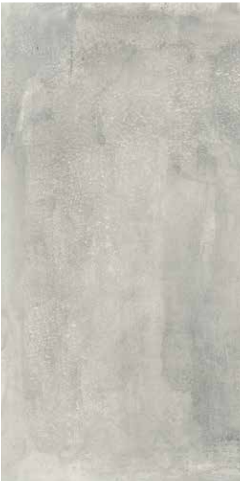
| 24x48 |