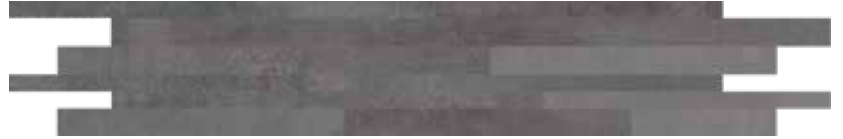
| 6.5x40 3D lineality |