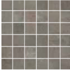
| 2x2 mosaic |