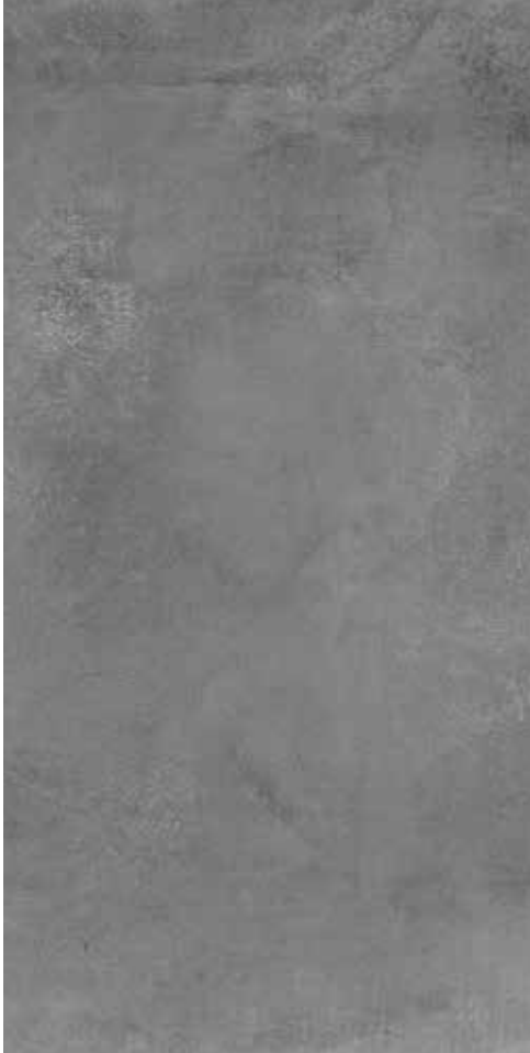
| 24x48 |