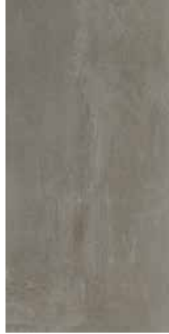
| 12x24 |