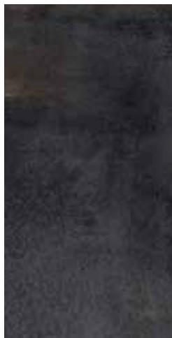
| 12x24 |