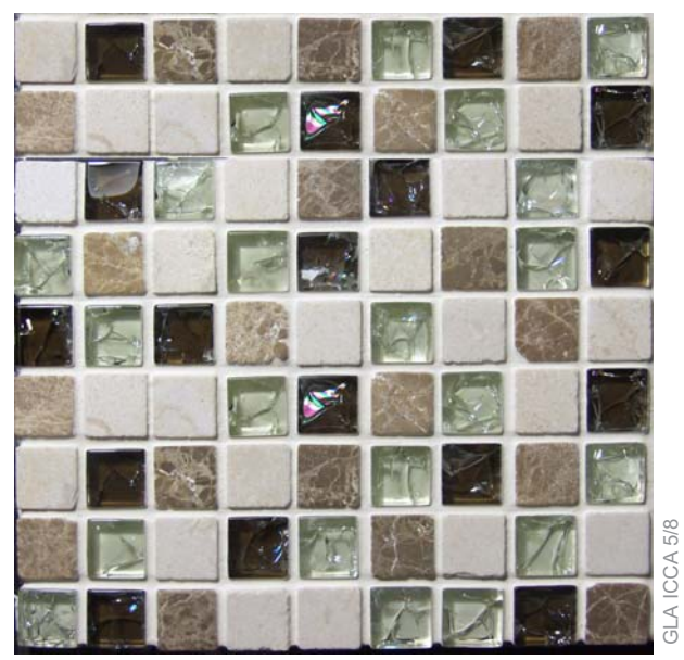
| caffe |