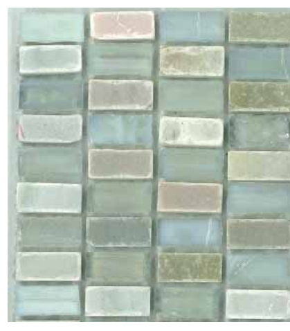
GLA HADU STACK