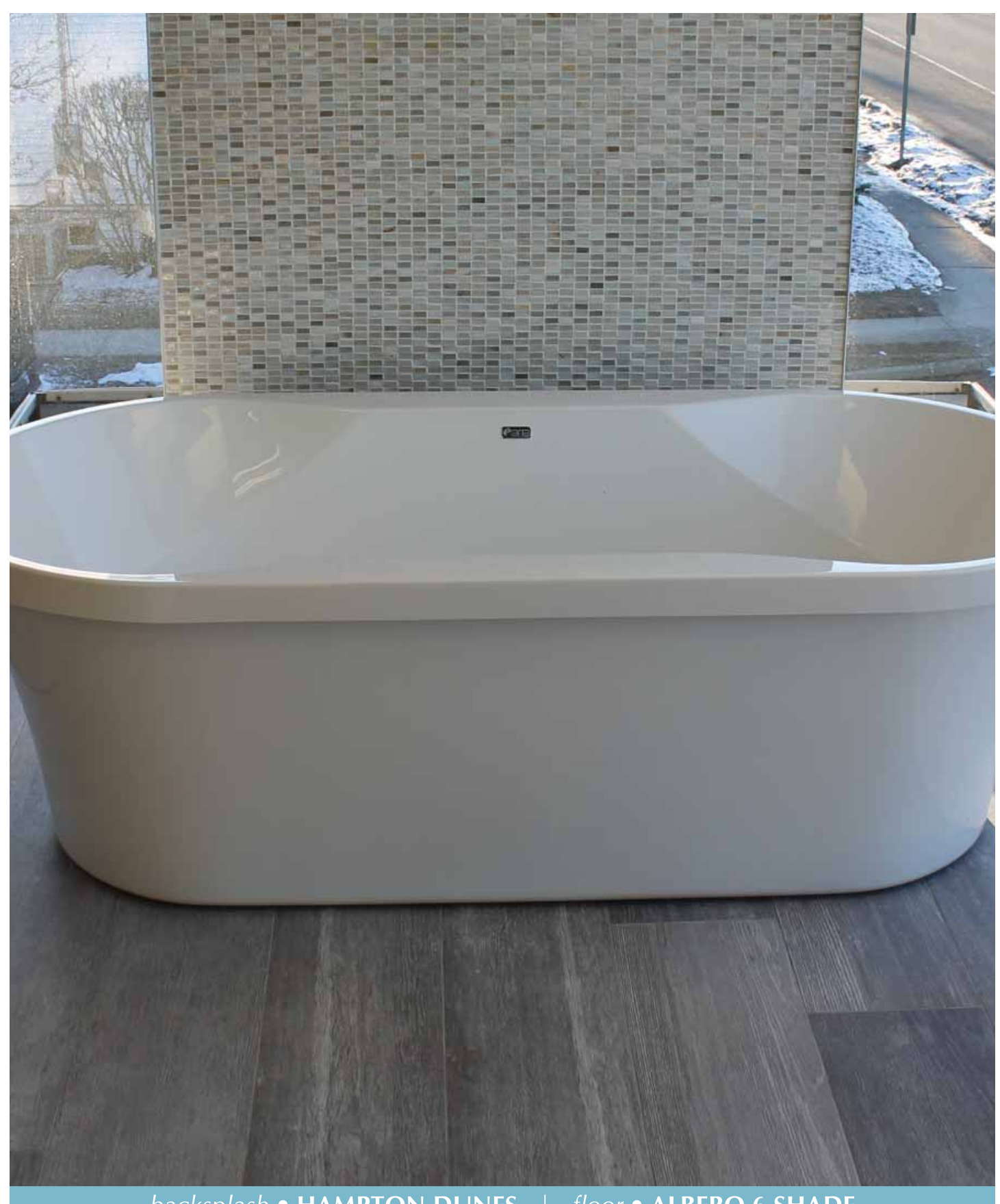
floor • ALBERO 6 SHADE backsplash • HAMPTON DUNES