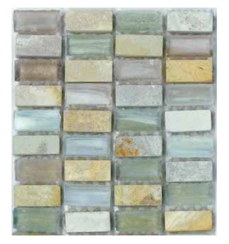
GLA HABE STACK