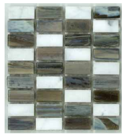
GLA HAHA STACK