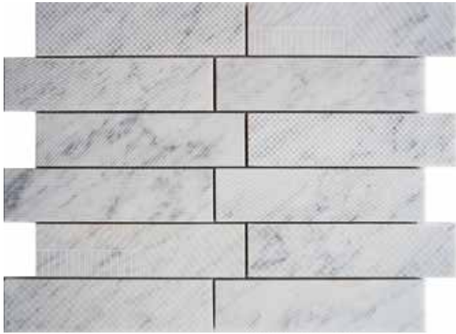
GLADMCA28 | 2x8 stack |