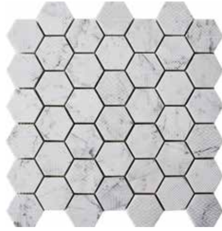
GLADMCAHEX2 | 2x2 hex |