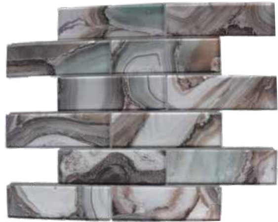
Dark Grey GLAAGDG62